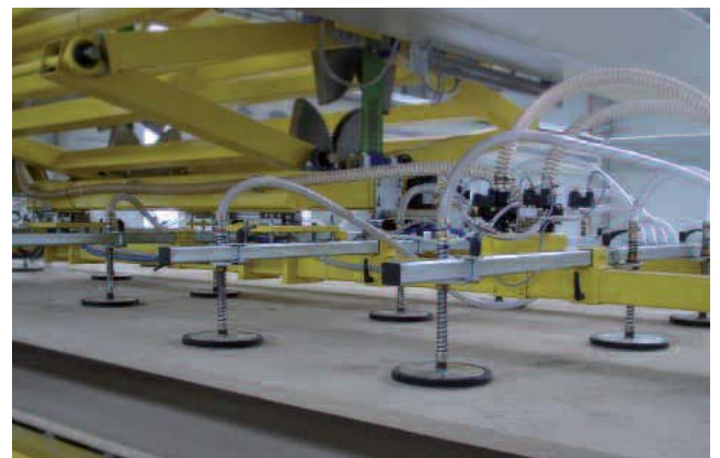
Vacuum spider SSP for commissioning of metal sheets