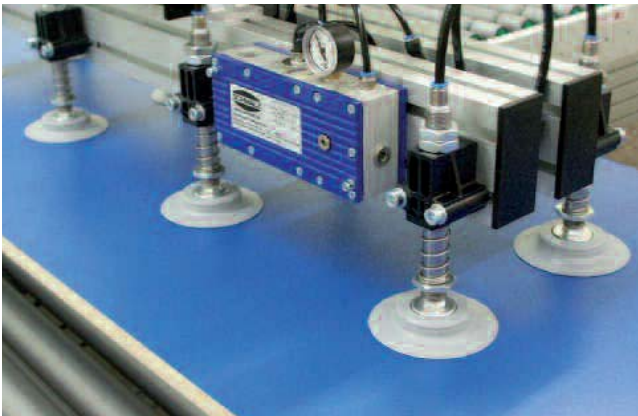
Vacuum spider SSP for handling furniture elements

Tailor-made complete systems for individual applications