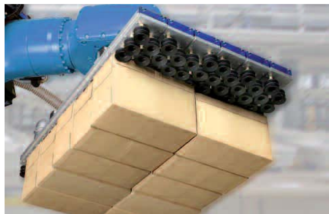
Large-area vacuum gripping system SPZ with individual suction pads for handling complete layers of cardboard boxes