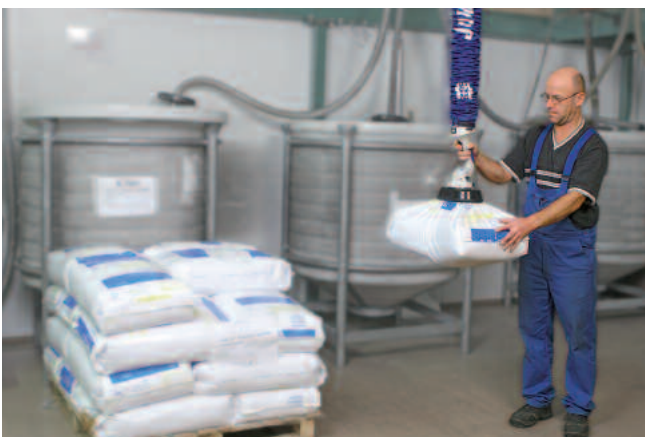
JumboFlex, maximum load 25 kg, with sack suction pad for handling sacks