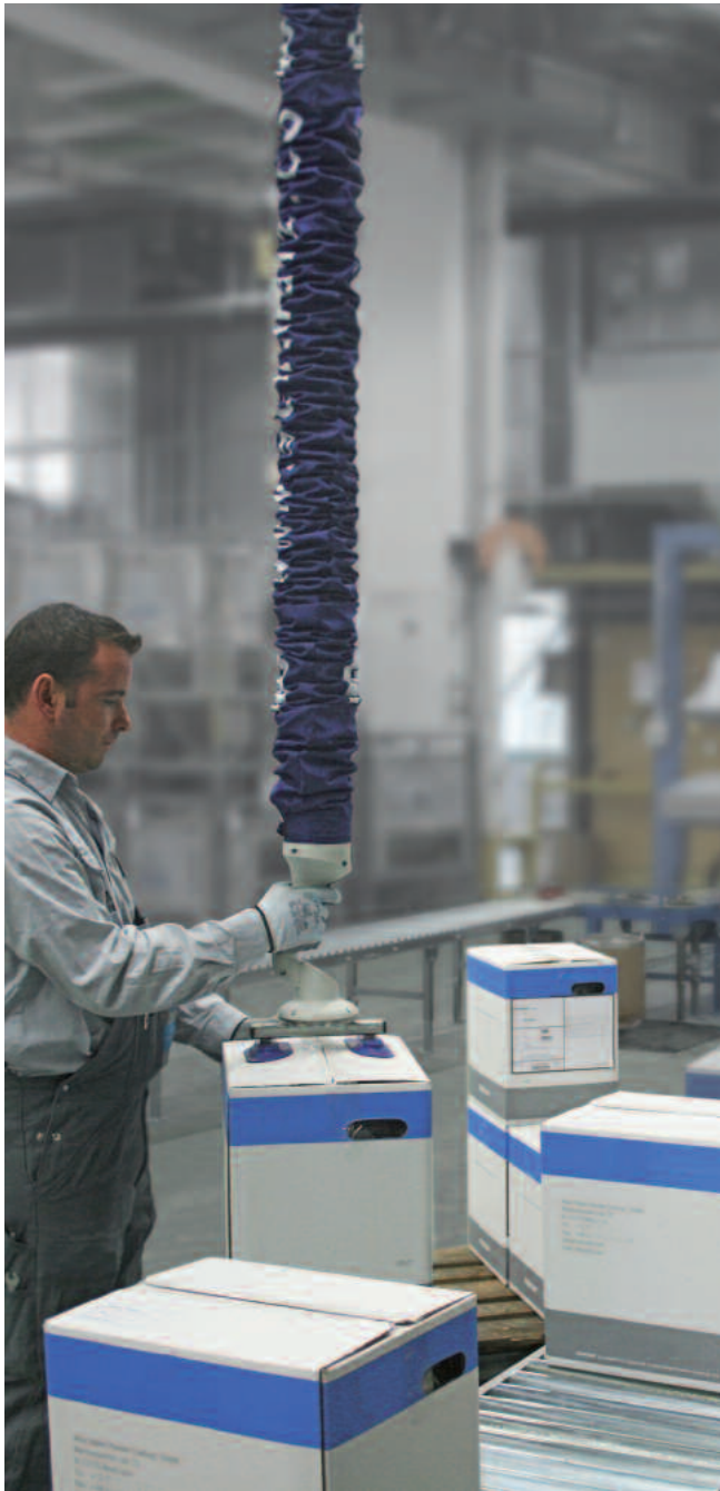
JumboFlex, maximum load 35 kg, with double suction pads for handling cardboard boxes in the shipping area