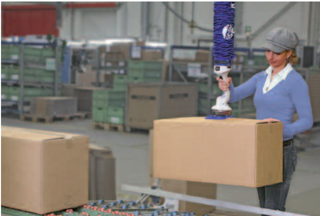
JumboFlex, maximum load 35 kg, with double suction pads for handling cardboard boxes

Versatile lifting and moving with a single hand