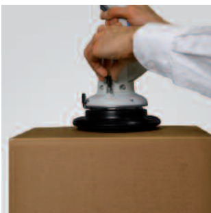
Rotation without limits