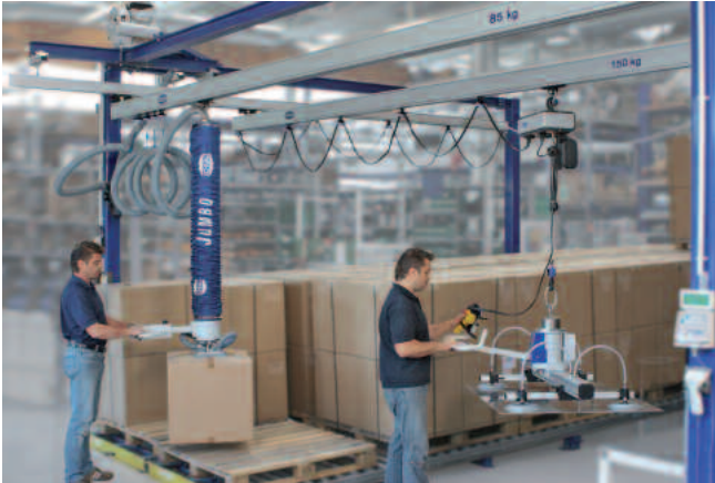
Aluminium crane system with one beam, 85 kg or 150 kg load, 2x6 m or 4x6 m

Our comprehensive services in the areas of consulting, project planning, inspection and maintenance guarantee that you are always in safe hands.