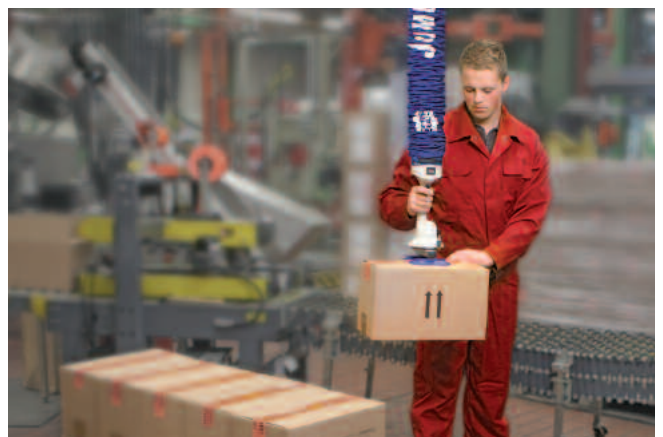
JumboFlex, maximum load 35 kg, with double suction pads for handling cardboard boxes