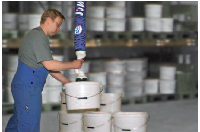
JumboFlex, maximum load 35 kg, with round suction pad for handling buckets