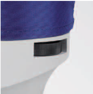
Setting the suspension