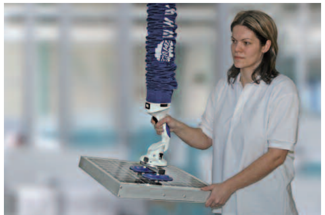
JumboFlex, maximum load 35 kg, with double suction pads for handling solar panels