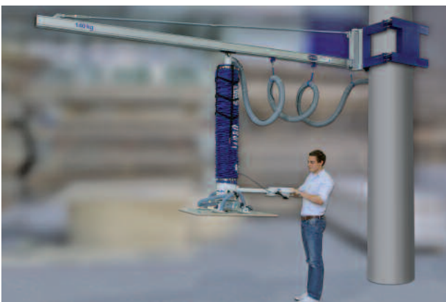
Attached to a concrete column, maximum load 140 kg, 4.5 m jib length