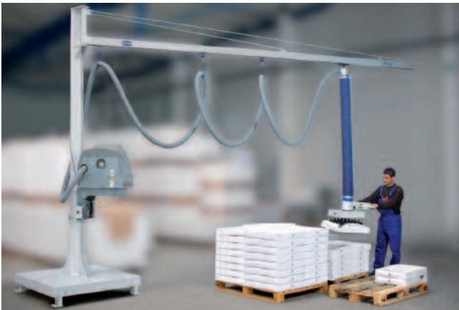
Slewing column crane with aluminium crane rail, maximum load 65 kg, 5 m jib length with base plate