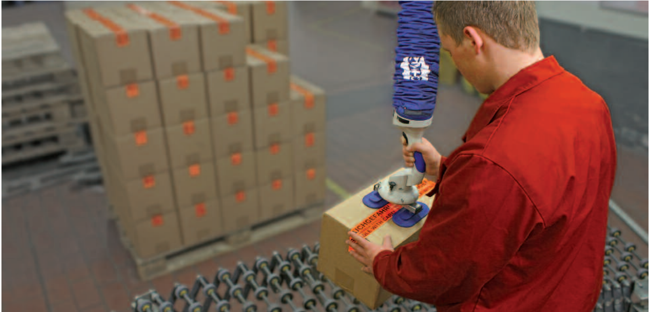
JumboFlex, maximum load 35 kg, with double suction pads for handling cardboard boxes

Flexible and efficient workpiece handling