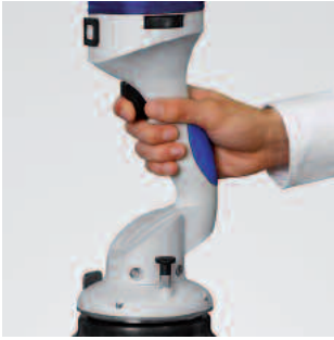
Integrated one-finger controller