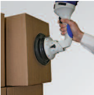
Flexible pick-up and suspension of the load