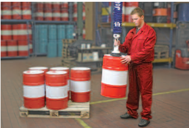
JumboFlex, maximum load 35 kg, with round suction pad for handling barrels