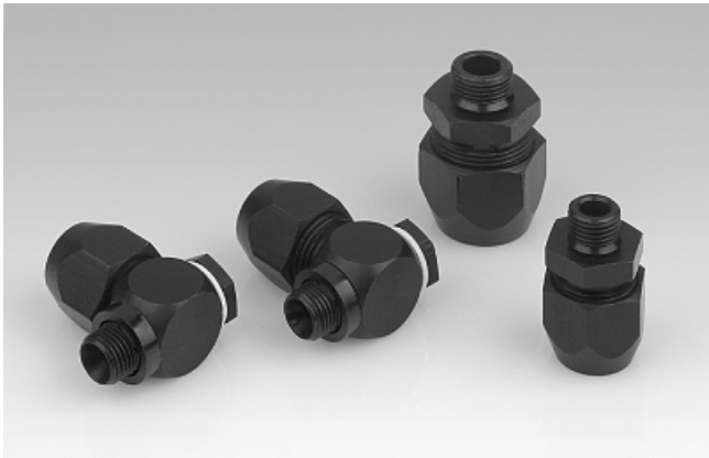
Unions with union nuts EIV-GE, EIV-W