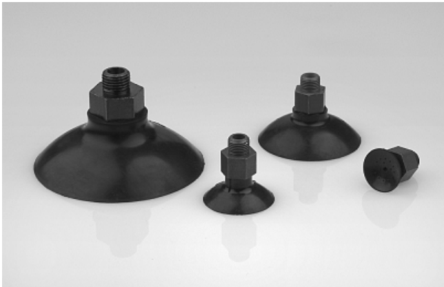
Special suction pads SGN 20 to SGN 100